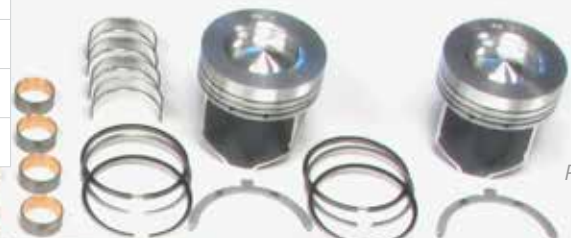
Part # RP1332

Kubota V3300 and V3800 Series engines are installed in a broad range of agricultural tractors, construction and industrial equipment. Applications also include industrial engines and generators.