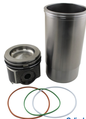
Cylinder Kit – with liner o-rings Part #: NRE559262